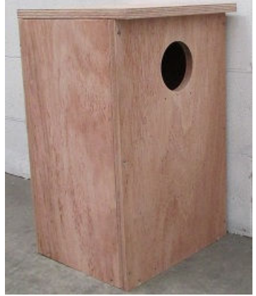
Last updated on 21/11/2014

Attach the roof with screws and/or hinges. Just add birds!